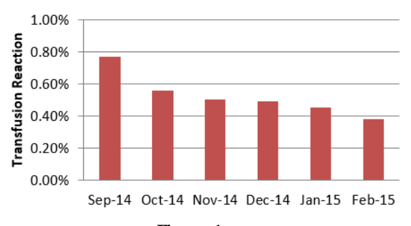
Figure 1. Incidence of Transfusion Reaction in Sanglah General Hospital Bali

transfusion reactions per total blood bags transfused was respectively 13/2323, 10/1980, 10/2030, 9/2011, 9/2327. The incidence of transfusion reactions found was mostly those of the components of Pack Red Cells (PRC) followed by the component of Thrombocyte Concentrate (TC) and only a small portion of the components of Fresh Frozen Plasma (FFP).