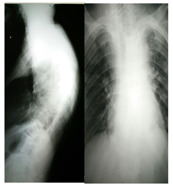
Figure 1. Plain spinal x-ray of thoracic spine show significant bone abnormality as kyphotic deformity.

underwent posterior approach and all patients used body brace for minimum 2 months and continued physical therapy for two months. Plain x - rayobtained at day 3 post- surgery and after 2 months of follow up. Follow up CT scan obtained at 8 weeks postoperatively and at least 2 months of follow-up was performed in all patients (range 2-24 months). Neurologic status were recorded after 2 months of follow up. American Spinal Injury Association (ASIA) scale was used to measure the neurological condition. The JOA (Japanese Orthopaedic Association) scoring system for evaluation of myelopathy. All of the aforementioned procedure was conducted by the author.