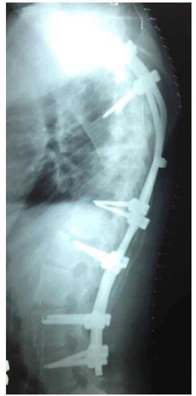
Figure 3. Postoperative x-ray showinstrumentation and correction of kyphotic Pott's.