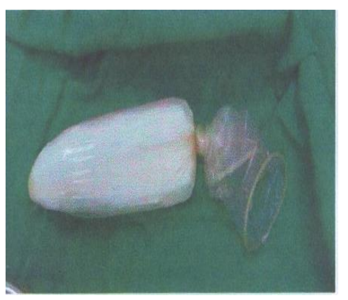
Figure 1. A regular unmodified Styrofoam mold

15-year-old adolescent Α woman complained an abdominal pain and could not have a menstrual period for 3 months after the surgery of a transverse vaginal septum, with a history of vaginal surgery 7 months ago to treat a primary amenorrhea caused by a transverse vaginal septum. A regular menstruation was established for 3 months after the surgery of the transverse vaginal septum, and then followed by a secondary amenorrhea. A gynecological examination and an ultrasound examination supported the presence of hematometra and hematocolpos resulted from a vaginal obstruction after the excision of the septum. The patient was given a surgery to open the obstruction and a modified mold was fixed by installing a nasogastric tube in it that serves as an irrigation channel of blood and vaginal fluid. The mold was coated with a fresh amniotic membrane, obtained from donors who had been prepared for an elective cesarean section surgery on the same day. The mold was maintained for 10 days in the vagina. On the tenth day, the mold was released and an irrigation was performed with a physiological fluid. Next, the patient was recommended to use a vaginal dilator coated with a condom for 2 to 4 months. After the surgery, the patient's quality of life improved. It was characterized by the loss of pain in the lower abdomen. A follow-up in 2 weeks showed no sign of obstruction, and the vaginal wall had healed well.