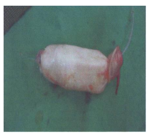
Figure 3. The mold was modified by coating it with the membranes