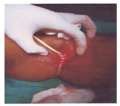
Figure 6. The modified mold, post-fitting.