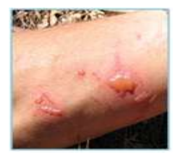
Figure 2 Effect of R.chalepensis in hot weather

Rumexnervosus is commonly found near and around the terraces of high altitude areas (above 1000m.). Genus Rumex is a genus of about 200 species of annual, biennial and perennial herbs in the buck