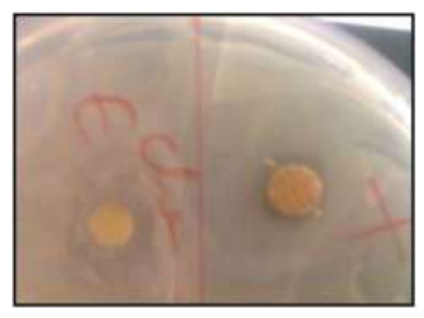
Figure 5 Antimicrobial activity of Ethanolic extract of Rutaceae (Chena Adam) against E. Coli

The activities observed for both plants are in concordant with the positive control that inhibited with an average of 9 mm in both the positive and negative gram bacteria. E. coli and S. aureus which are also resistant to different antibiotics had their growth inhibited by acetone, ethanol and aqueous extracts of R. chalpensis and R. nervosus (Figure 6 and 7).