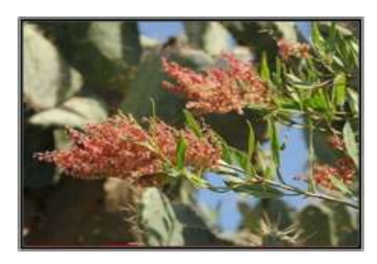
Figure 3 The leaves and flower Rumex nervosus

Rumex species are used as food plants by the larvae of a number of Lepidoptera species. The leaves of most species contain oxalic acid and tannin, and many have as tringent and slightly purgative qualities. Some species with particularly high levels of oxalic acid are called sorrels (including sheep's sorrel, Rumex acetosella, common sorrel, Rumex acetosa and French sorrel, Rumex scutatus), and some of these are grown as pot herbs or garden herbs for their acidic taste. Rumex species contains anthracene derivatives like chrysophanol, physcion, emodin, aloe-emodin, rhein; which are the main biologically active compounds responsible for anti-cancer, cytotoxic, properties.<sup>12</sup> mutagenicity genotoxic and Traditionally, in Eritrea, the leaves, stems and some times roots of Rumex nervosus are used as traditional medicines, for the eye disease, taeniacapitis, haemorrhoids, wounds, infected arthritis, eczema, abscess and gynecological disorders.