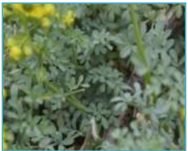
Figure 1 The leaves and flowers of R.chalepenis

glycosides, glucosinolates, sterols and/or triterpenes. Ruta is also one of the most frequently plants for medicinal purposes. characteristic odour of the plant and volatile oil is due to methyl n-nonyl ketone.8 There are two main species of Ruta used in traditional medicine; Ruta chalepensis and Ruta graveolens.9 Traditionally, Ruta is also used as remedy for many inflammatory diseases. 10 Furthermore, extracts from rue have been used to treat eyestrain, sore eyes, and as insect repellent. Rue has been used internally as an antispasmodic, as a treatment for menstrual problems, as an abortifacient, and as a sedative.In Saudi Arabia, a decoction of the aerial parts of the plant is used as an analgesic and antipyretic and for the treatment of rheumatism and mental disorders. The plant is prescribed in the Indian system of medicine for the treatment of dropsy, neuralgia, rheumatism and menstrual and other bleeding disorders. In China, a decoction of the roots of the plant is used as anti-venom. The extracts of Ruta have an oxidative property which can control the colon cancer. 11 During the tropical usage of the Rue extracts care must be taken, after applying to the skin with sun exposure, the oil and leaves can cause blistering. Traditionally, in Eritrea, the leaves of Ruta are used for myalgia, cold, whooping cough, abdominal pain, anti-emetic and many more.