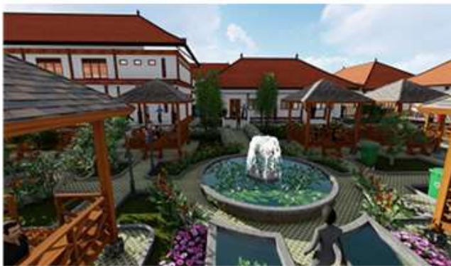
Fig. 4. Hardscape and Softscape

The types of plants selected in the outer space area according to the aroma and shape that can stimulate the five human senses in the outer space area, the types of plants in this area are Allamanda Cathartica, Brunfelsia Pauciflora, Saraca Asoka . In addition, in each of these areas there are two fountain pools, these fountains aim to stimulate the human sense of hearing because the sound of the fountain can make a feeling of calm and comfort.