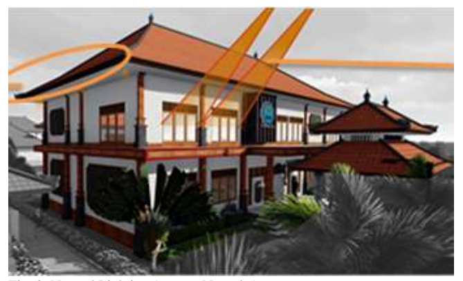
Fig. 2. Natural Lighting (source: Nugraha)