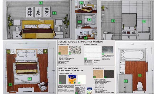
Fig. 4. Scandinavian Concept Material Settings in the Deluxe Room Interior

To create a room that is relieved, the colors used are light colors to classify the dimensions of the room so that the room does not feel stuffy and tight. The color used is predominantly white in accordance with the Scandinavian concept. In the bedroom the dark gray color was chosen on the wall of the backdrop of the bed intended as a point of interest in the room so as to avoid the impression of a monotonous room, the dark gray color was chosen because it was still classified as a light color and in accordance with the characteristics of the Scandinavian concept. Whereas in the bathroom using ceramics with white in order to display a clean impression on the bathroom wall. Besides the addition of some artwork such as paintings on the bedroom backdrop and the addition of vegetation on the bedroom and bathroom gives more appeal to the room.