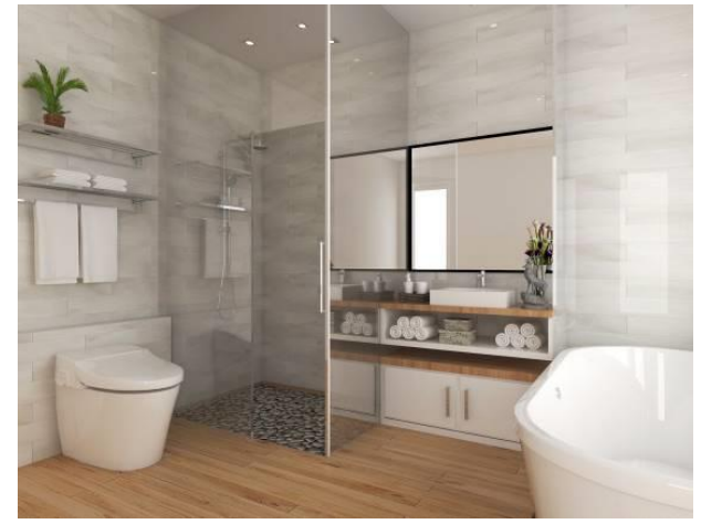
Fig. 5. Scandinavian Concept Material Settings in the Deluxe Room Interior

In Figure 4 is a visualization of the application of the Scandinavian concept in the Deluxe Room Interior. Can be seen in the bedroom using neutral colors to make the room look spacious and clean, the shape of the furniture is more concerned with function and at the entrance of the Deluxe Room there is a sliding door with dimensions large enough to maximize the incoming light. In the bathroom also uses neutral colors with different uses of elements in dry areas using wood floors while in wet areas using white pebbles.