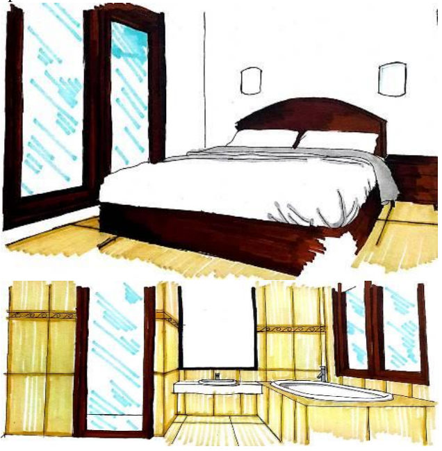
Fig. 2. Interior Perspective

maximize air circulation and incoming light so as to reduce the use of artificial lighting and ventilation in addition to that the openings are also functioned so that the room feels more spacious.