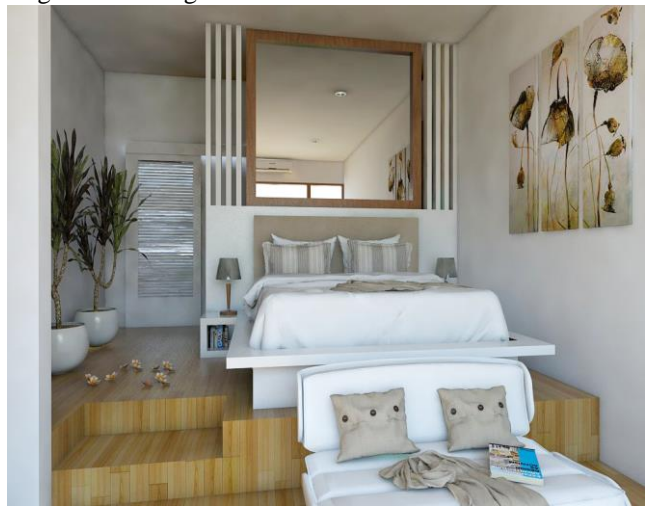
Fig. 4. Perspective Interior

The application of the parquet in the el-emen under the hotel room aims to give the impression of luxury and elegance so that guests are comfortable in that room.