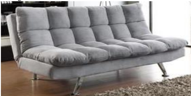
Fig. 5. Furniture for Interior

The application of furniture in the interior of the room uses geometric and arched furniture with a wide angle and uses a neutral color combination with a wooden frame that has a small diameter. As for the application of color finishing in this interior using natural colors such as wood color that is brown combined with other neutral colors such as white, gray and golden brown. Lighting in this room uses indirect lighting such as hidden lights that are located above the ceiling or on the floor.