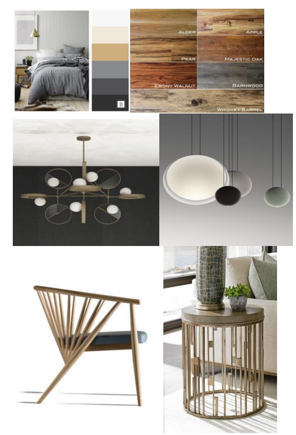
Fig. 2. Luxury Furniture Interior