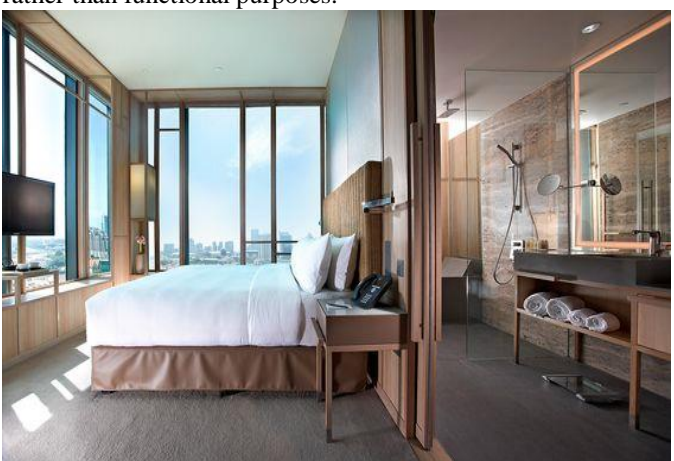
Fig. 1. Luxury Model Interior

Determination of the concept of rooms in a hotel can also have a major effect on the comfort and harmony of buildings with one another, the concept applied to boutique hotels, especially in in-terior rooms is luxury, this concept is only applied to residential and luxurious rooms and focuses on the use of furniture and good quality material and has aesthetic value more than the value of its function. The application of luxurious concepts in room interiors includes aspects of the use of furniture, aesthetic elements, walls, floors, colors and lighting. The characteristics of the luxurious concept are as follows, (1) the use of furnishing with materials with special workmanship, (2) has an aesthetic value that is more than the value of its function, (3) uses furniture and interior elements of good quality and seems luxurious and is specially designed by the famous desaigner. (4) the use of precious metal materials such as gold and silver. (5) the interior elements used prioritize art rather than functional purposes.