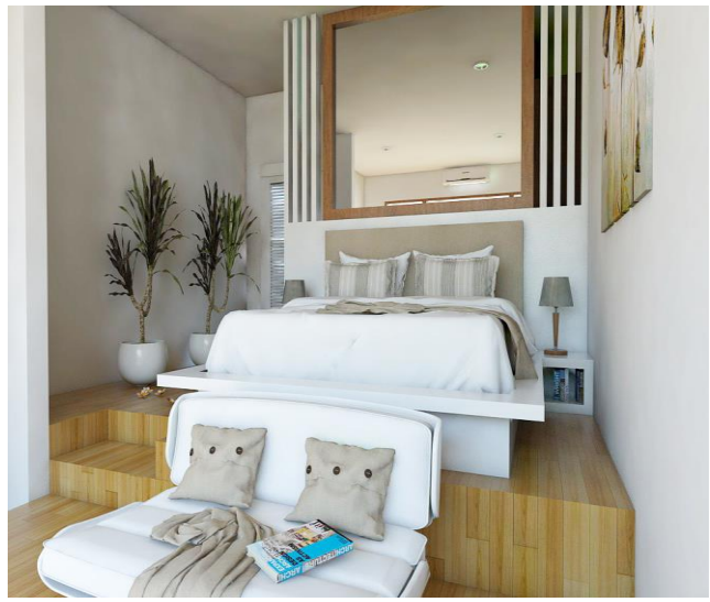
Fig. 6. Interior Concept

Application of furniture using geometric shapes and using a neutral color combination can make the atmosphere of the room to be more elegant.