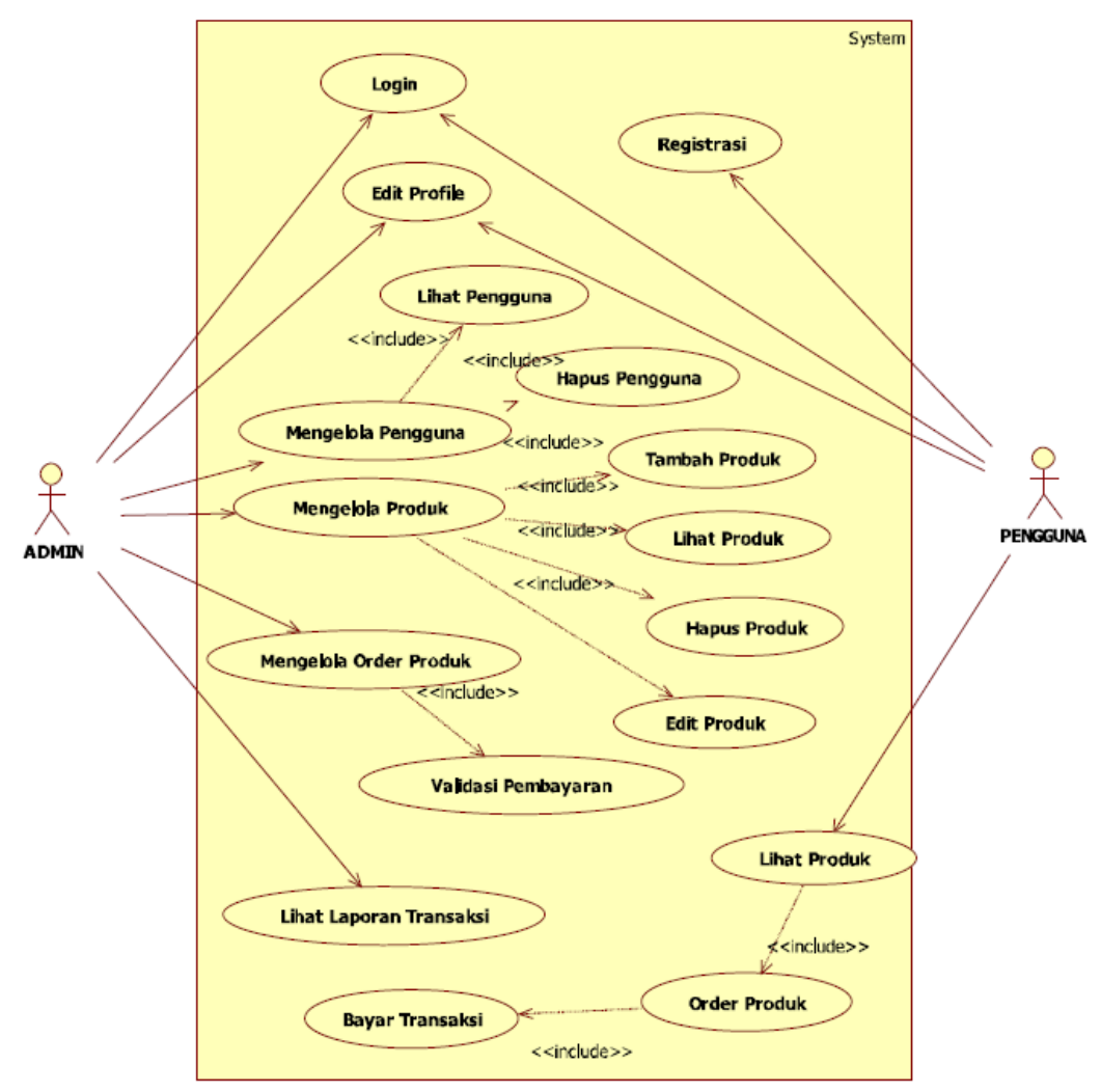
Figure 2.2 Use Case Diagram

Maintenance of a software is needed, including development, because the software is not always just like that. When running it may be that there are still small errors that were not found before, or there are additional features that do not yet exist in the software. Development is needed when there are changes from external companies such as when there is a change in the operating system, or other devices.