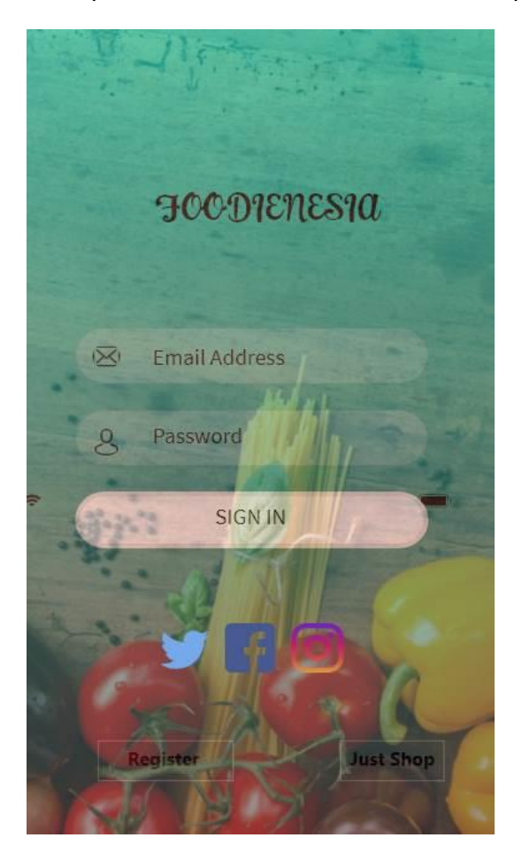
Figure 3.1 Login Page

The developed application is in the form of mobile app and can be accessed using a mobile phone. Here are the results of the implementation of the application made.