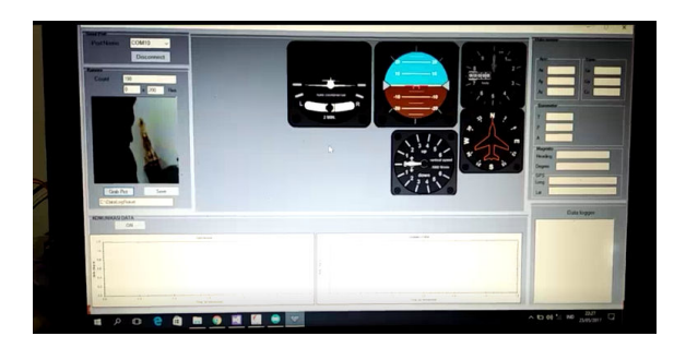
Fig. 4. The Payload test results when shooting

On the Ground Segment also contains functions for ordering the shooting through a camera in the payload. At the time of the command button to take a picture is clicked then GCS will send serial commands to the system so that the data payload sensors while stopped and carried out the taking and delivery of image data in the form which is then treated hexadecimal in GCS and displayed in the form of pictures. In Figure 4 looks at testing the rocket's payload image data retrieval when done testing.