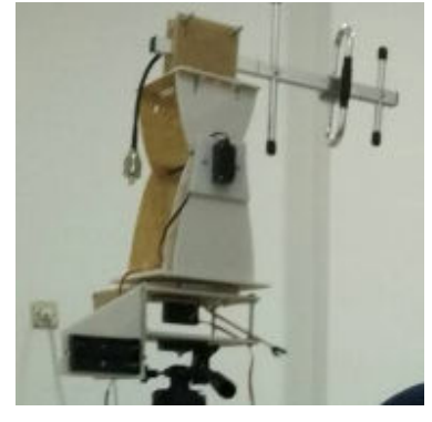
Fig. 5. Realization of the antenna Tracker

Antenna tracker designed using 900 MHz 60 dbi yagi. On the system of the antenna using the arduino uno, HMC5883L, compass sensor ublox neo 6 and servo motor. The antenna will get the value of the Longitude and Latitude of the GPS on payload sent from ground segment. Then the latitude and longitude values will be compared to the values obtained by the GPS antenna system. And the servo on the antenna will rotate the antenna direction accordance with the comparison data. In Figure 5 indicated the form of realization of the antenna Tracker