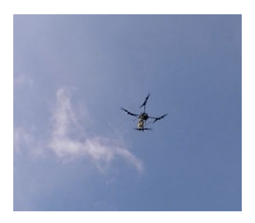
Fig. 6. The launch of the rocket's Payload

and spacecraft launchers. While the process of launching the rocket test charge is shown in Figure 6. In the process of this launch was successful and the data from the payload can be send to the ground control station. Accelerometer data delivery that was in the payload sent in real time starting from a distance of 0 up to 500 meters. After passing over a distance of 100 meters, deliveries disrupted and disjointed. Radio telemetry data from the specifications used are of 100 mW, with a range as far as 1000 meters.