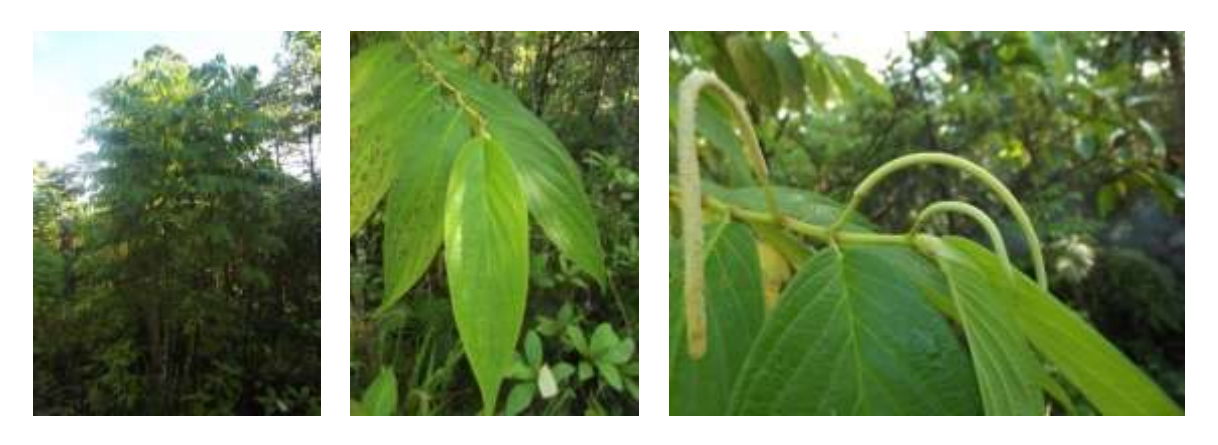
Figure 1. Piper aduncum (leaves and fruits)

All the processes and antifungal testing of essential oil of P. aduncum were conducted at Laboratory of Applied Botany of Bali Botanical Garden, while sequencing of phytochemical was carried out at the Development Unit for Clean Technology - LIPI. The sample materials were the leaves and fruits of P. Aduncum obtained from Bali Botanical Gardens with registered number XV.B.229 (Figure 1). We selected leaves which are not too young and not too old, while the fruits were mature (but not ripen yet). We considered picking period for sample materials to yield an optimum amount of essential oil.