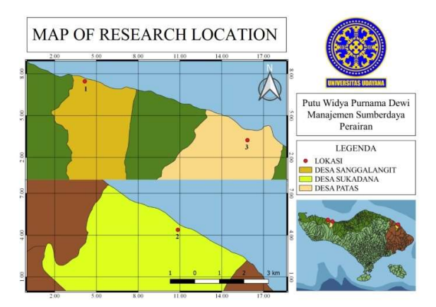
Figure 1. Sampling Location

Village, Sukadana Village and Patas Village). The culture media used were Thiosulfat Citrate Bile Salts Sucrose Agar (TCBSA) and Nutrient Agar (NA). Antibiotics were tested using eight types including tetracycline, oxytetracycline, enrofloxacin, ciprofloxacin, amoxycillin, doxycycline, ampicillin, and erythromycin. The tools used in this research are laminary airflow, incubator (Memmert UNB 400), microplate, microplate reader (Zenix 320), and autoclave (Hiclave HL Series).