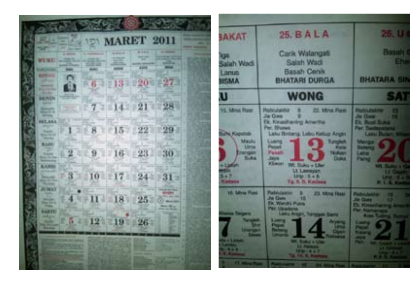
Balinese calender

An observation on a Balinese household wall calendar will give a good illustration. A Balinese household wall calendar is different from other calendars as it has all the sytems that the Balinese recognize put together in the printed paper. So they have Gregorian, Pawukon, Caka and even Chinese one. The calendar will tell the Balinese when a temple ritual will be carried out as in each days there is information on the Pawukon feature of the day. However, most likely those temple festivals happen during weekdays when the color of the day is black, meaning workdays. Most of the day that colored red, meaning holidays, are national holidays and there is only one Balinese national holidays that is the Caka new year. This means the urban Balinese need to choose between going to work or skip a day to participate in the temple ritual.