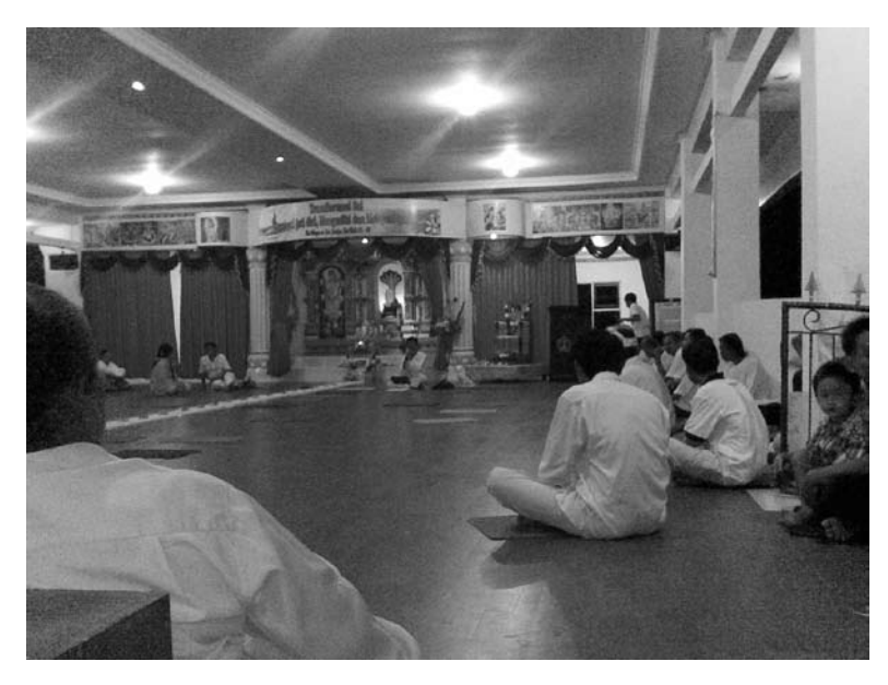
Followers are gathering to have a discussion after bhajan at the Sai Centre in Panji.