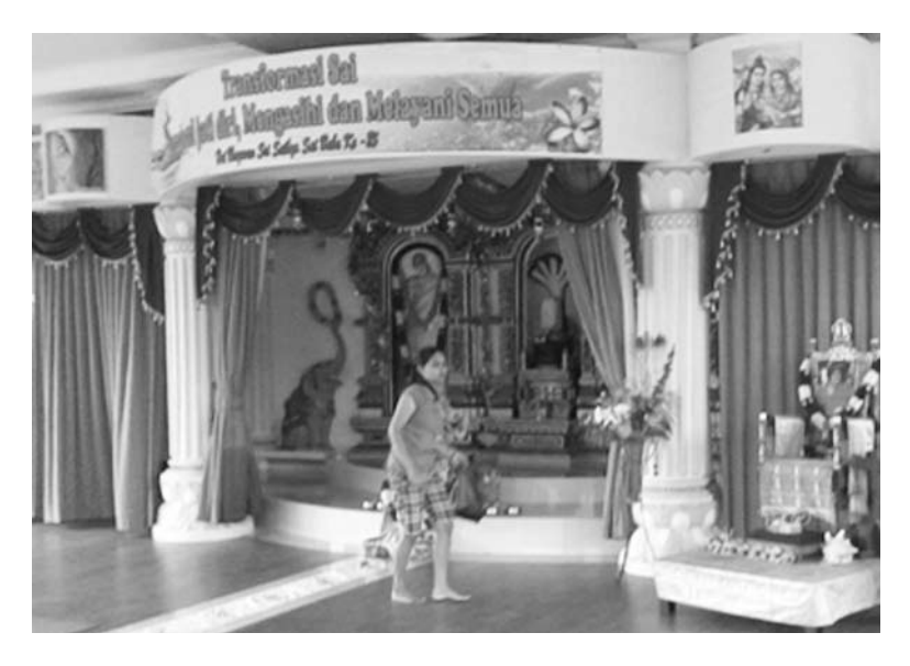
A follower preparing the hall with equipment before bhajan.