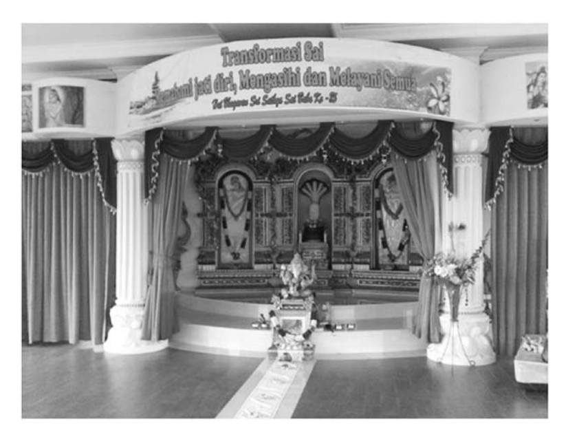
The hall of the Sai Baba center in Panji where they usually carry out bhajan.