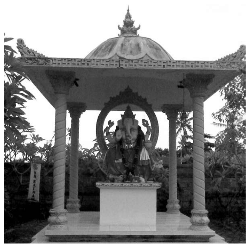
A Ganesha statue at the front yard of the Sai Centre in Panji.

This paper will argue that Sai Baba movement is generally urban phenomenon which made possible by the economic transformation from agricultural to modern economy. The changing of occupations in the new economy has created: 1) Migration, as people move from their villages of origin to the new workplace in the city, and 2) two emerging cultural spaces of Workplace in the city and Home in the village of origin. The Workplace as a cultural space brought with it a new logic of time. Adapting to this new logic of time, Balinese urbanites find it hard to maintain their Adat religion which still uses traditional Balinese