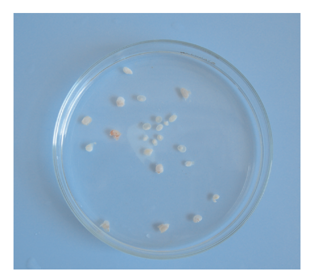
Figure 3. Some of the individual cysticerci isolated from muscle tissue

fault that might have occurred during administration of the eggs or it might be possible that the eggs were vomited any time after being administered. In this study we did not do around-the-clock observation on the three cattle after treatment. Table 1 shows distribution and density of the cysts in cattle 1 and 2.