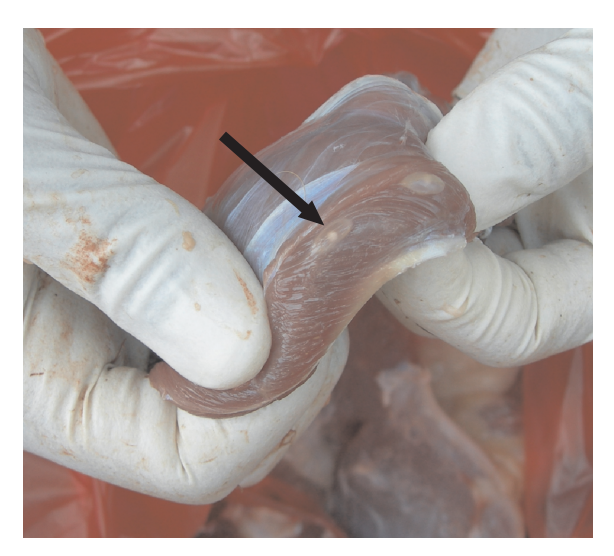
Figure 2. Showing two cysticerci in muscle tissue of the dorsal area